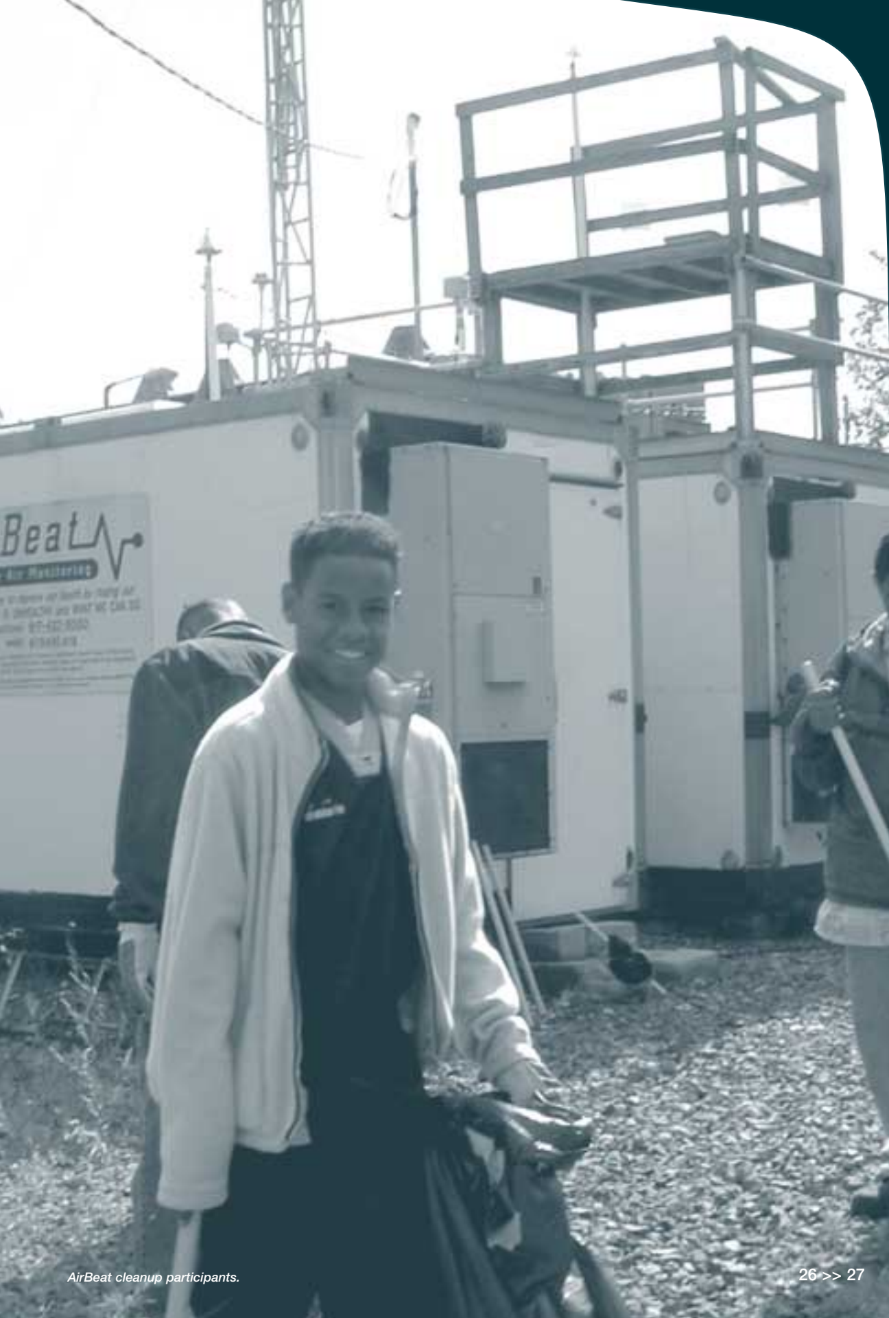
AirBeat cleanup participants.